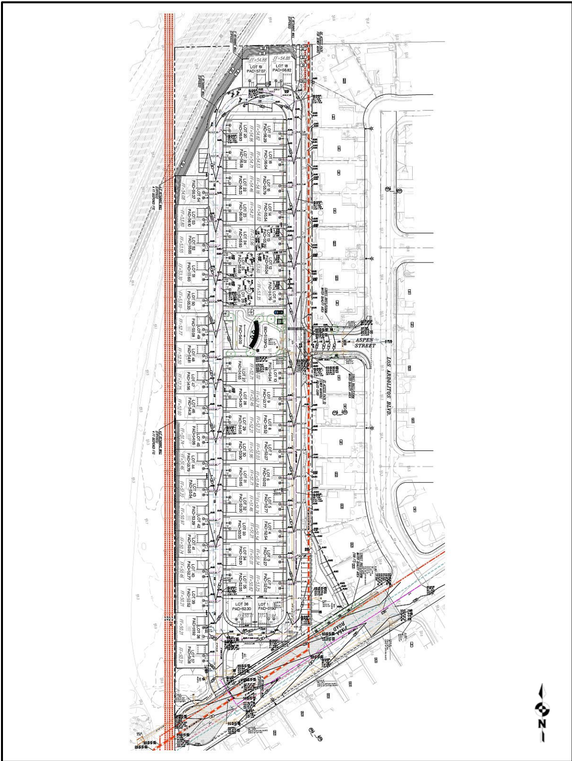
Figure 1-B: Proposed Project Site Plan