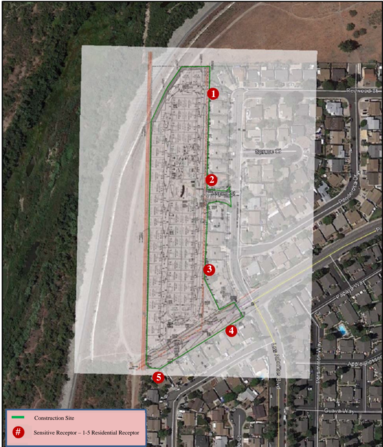
Figure 3-A: Construction Health Risk Model Setup