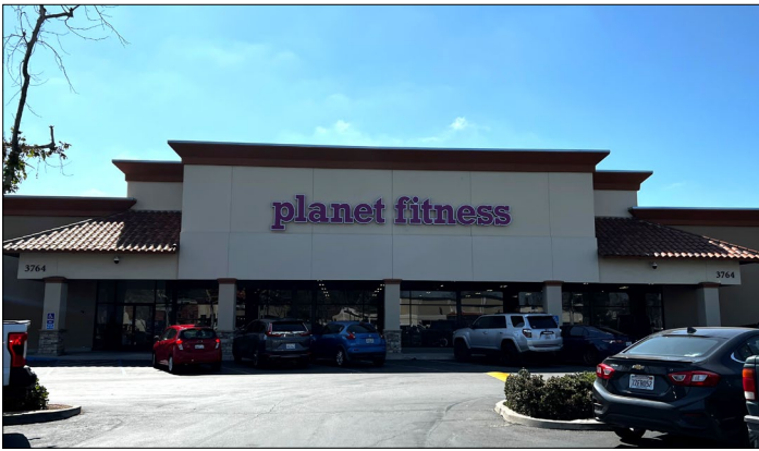
Planet Fitness recently opened at 3764 Mission Ave. in the Marketplace del Rio.