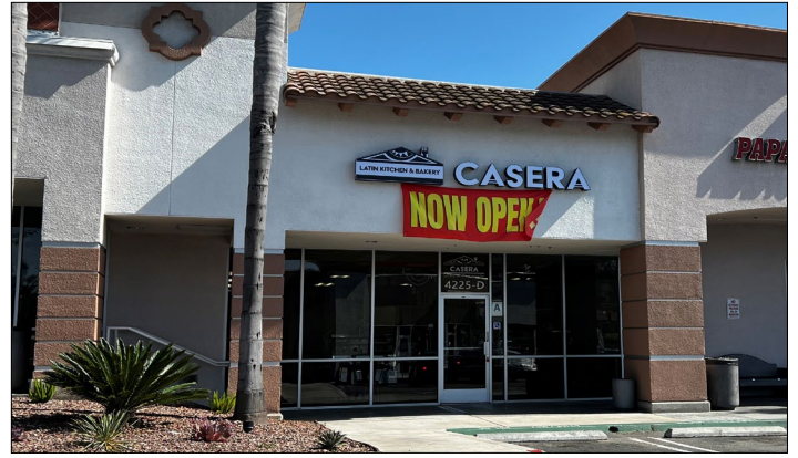
Casera Latin Kitchen & Bakery is now open at 4225 Oceanside Blvd., Ste D in the Rancho del Oro Gateway shopping center.