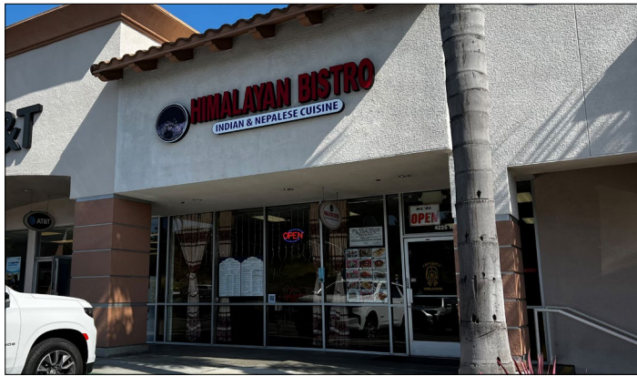
Himalayan Bistro Oceanside at 4225 Oceanside Blvd. in the Rancho del Oro Gateway shopping center.