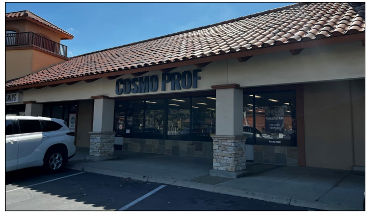
Cosmo Prof at 3762 Mission Ave. in the Marketplace del Rio shopping center sells salon professional products.