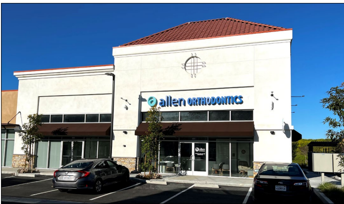
Allen Orthodontics is open at 1810 Rancho del Oro Rd., Ste 125 in the Arroyo Verde retail center.