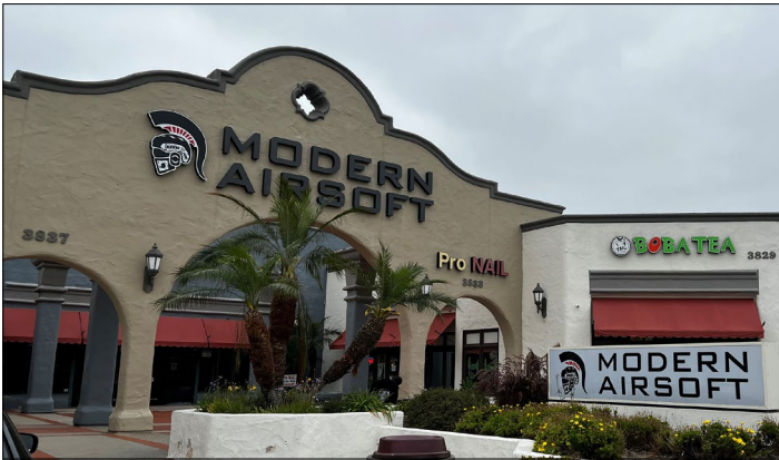
Modern Airsoft recently relocated to 3833 Plaza Dr. in the Tri City Crossroad center, selling airsoft guns, gear and accessories.