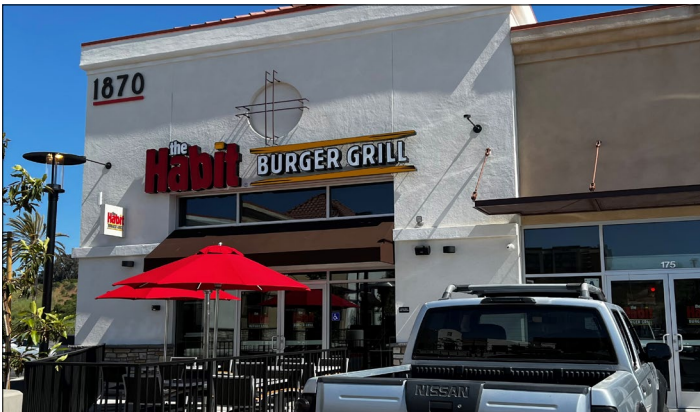
The Habit Burger Grill , which includes a drive-thru, is open at 1870 Rancho del Oro Rd. in the Arroyo Verde center.