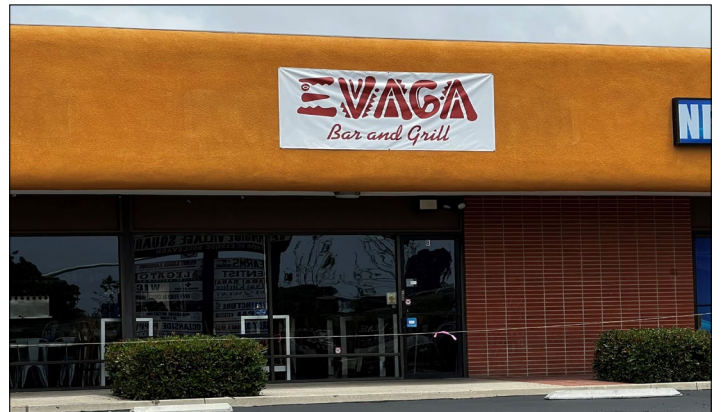
Evaga Lounge recently opened at 1906 Oceanside Blvd. in the Oceanside Village Square shopping center, serving Mexican food, cocktails and great music.