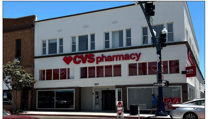
CVS is now open at 501 Mission Ave. in the Downtown Oceanside.