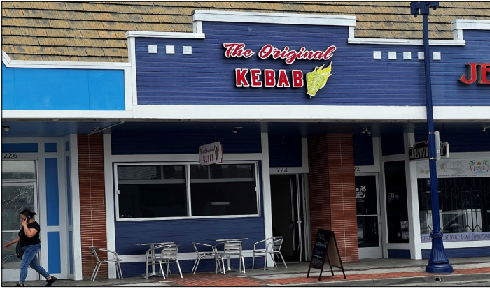
The Original Kebab recently opened at 224 N. Coast Hwy. in Downtown Oceanside, serving Mediterranean food.