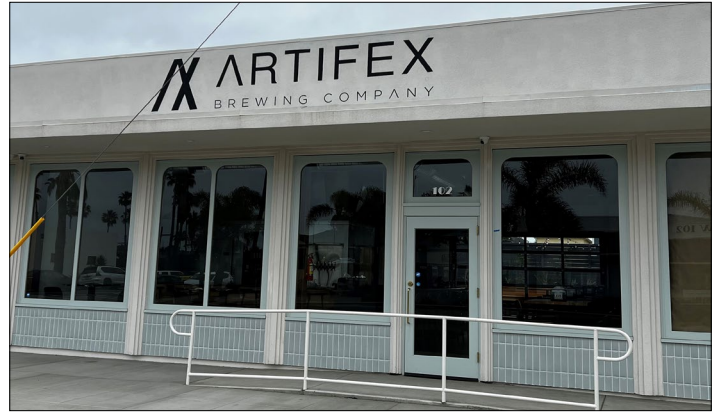
Artifex Brewing Company opened at 1940 S. Freeman St. Suite 102 in the Freeman Collective.