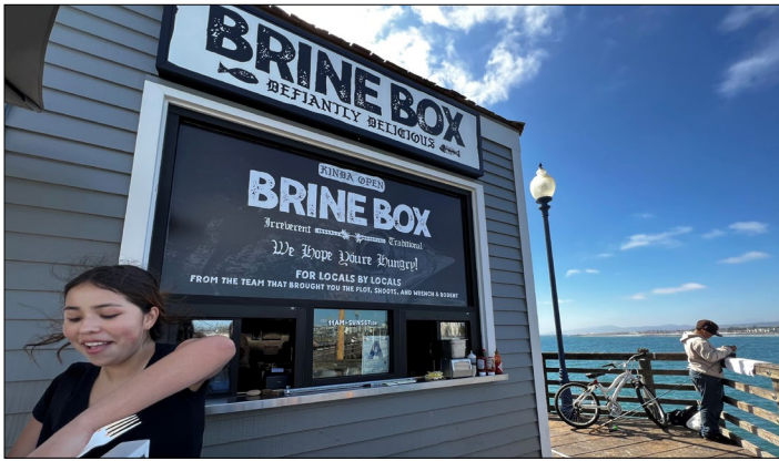
Brine Box recently opened at the end of the Oceanside pier, serving fresh local seafood, cheesy chowder tots, seasonal salads, classic fish & chips, and other tasty dishes.