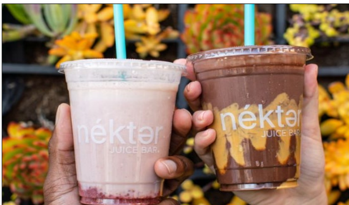
Nektar Juice Bar is now open at 3480 Marron Rd., Ste 3B-102, in the Quarry Creek shopping center. They serve handcrafted bowls, smoothies, and fresh juices.