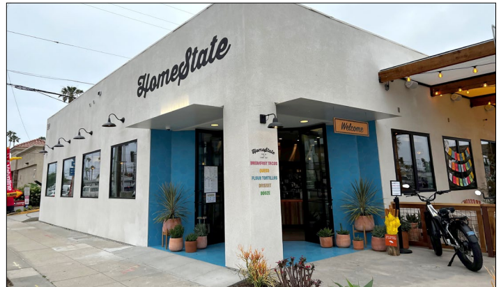
HomeState at 510 Vista Way in the Freeman Collective is a Texas kitchen serving breakfast tacos, queso, brisket, and house-made tortillas.