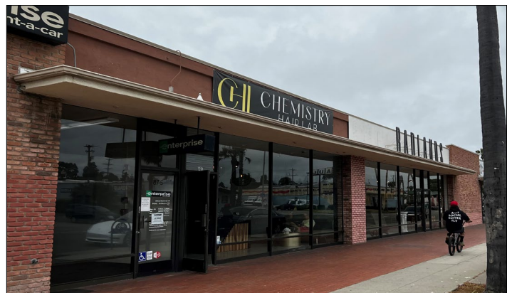
Chemistry Hair Lab recently opened at 865 S. Coast Hwy. They offer hair services, including hair extensions, hair coloring, keratin treatments, balayage, and more.