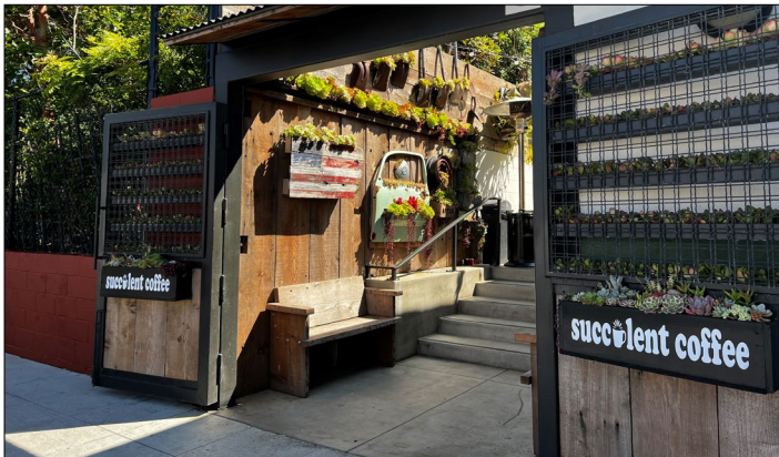
Succulent Cafe Oceanside is now open at the back patio of The Brick Hotel at 306 N. Tremont St. in Downtown Oceanside, serving coffee.