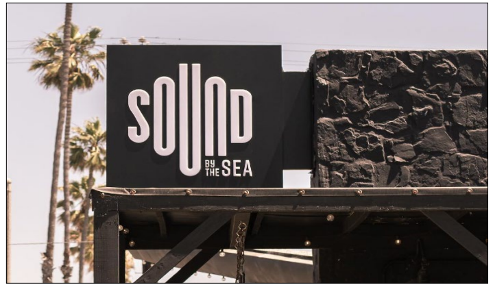
Sound by the Sea recently opened at 325 S. Coast Hwy. in Downtown Oceanside, a listening bar serving up crafted spirits and Mediterranean-infused small plates.