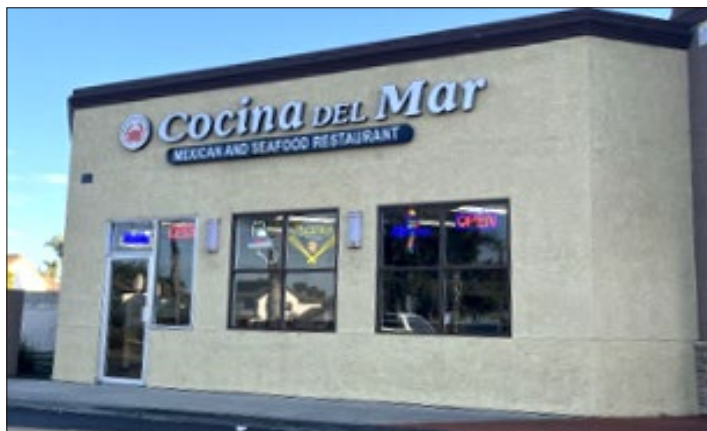
Cocina del Mar at 650 Douglas Dr. in the Douglas Square Center, offering authentic mexican dishes and seafood.