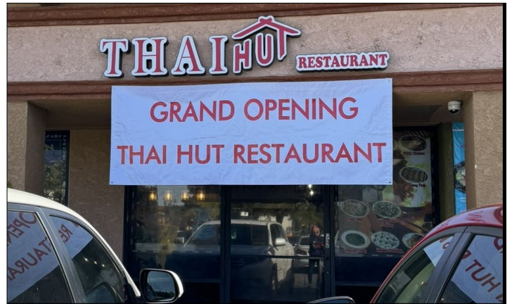
Thai Hut Restaurant at 3753 Mission Ave., in the Mission Camino shopping center., serving authentic Thai cuisine.