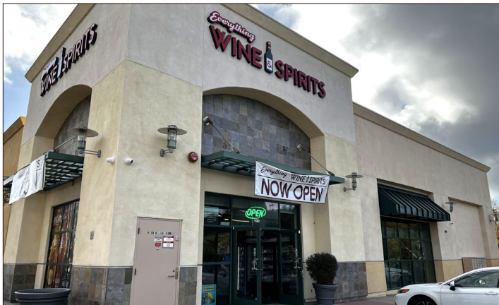
Everything Wine & Spirits at 4161 Oceanside Blvd., Ste 100. in the Del Oro Marketplace, offering a wide variety of spirits, wine and beer.