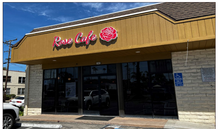
Rose Cafe at 1902 S. Coast Hwy. in South Oceanside, serving classical breakfast and lunch offerings.