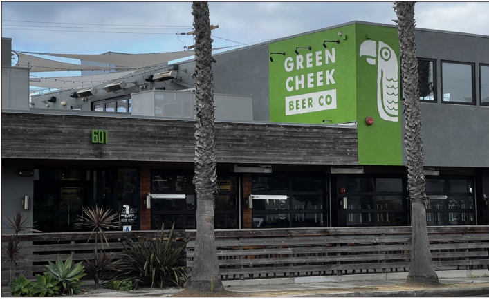
Green Cheek Beer Co. at 601 S Coast Hwy. in Downtown serving craft beers and a delicious in-house food menu.