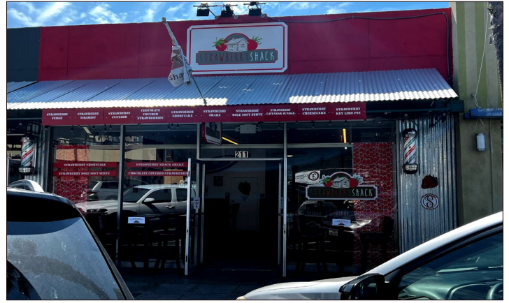
Strawberry Shack at 211 N Tremont St. in downtown Oceanside, offering strawberry desserts, ice cream and frozen yogurt.