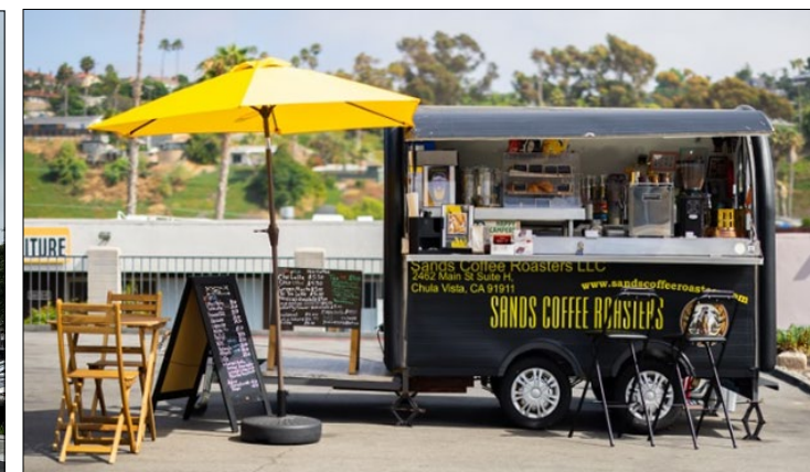
Sands Coffee Roaster at 2601 Oceanside Blvd., serving coffee, Arabic and Turkish coffee, and pastries.