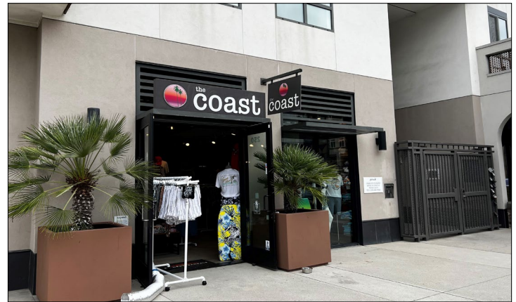
The Coast at 250 Mission Ave. in Downtown Oceanside sell women's and men's clothing, and accessories.