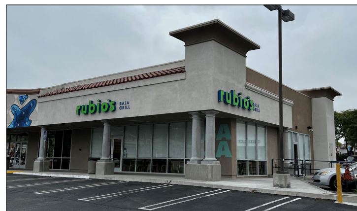
Rubio's Fresh Mexican Grill has reopened its new prototype restaurant at 4201 Oceanisde Blvd. in the Rancho del Oro Gateway shopping center. This site had been temporarily closed due to a 2021 fire.