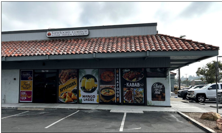
Tandoori Corner at 158 Roymar Rd., in the Valley Plaza, serves authentic Indian food.