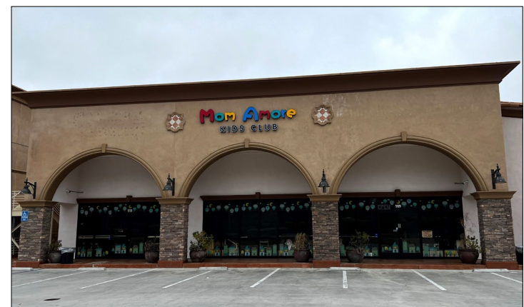
Mom Amore Kids Club is a new concept kids' club offering a unique experience for children, blending educational insights with unlimited fun at 4259 Oceanside Blvd. in the Oceanside Marketplace.