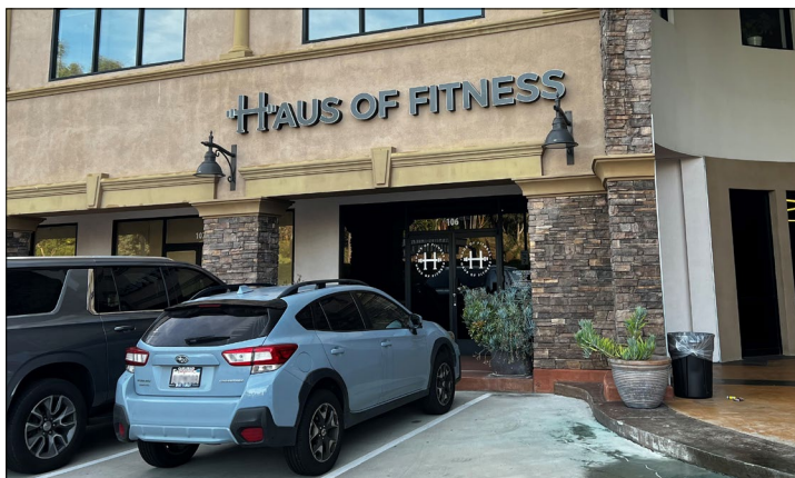
Haus of Fitness , a state-of-the-art facility, offering a wide range of workout equipment at 4263 Oceanside Blvd., Ste 103-106 in the Oceanside Marketplace.