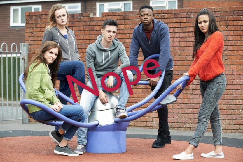
ANGRY TEENS, RUDE, USING PROFANITY